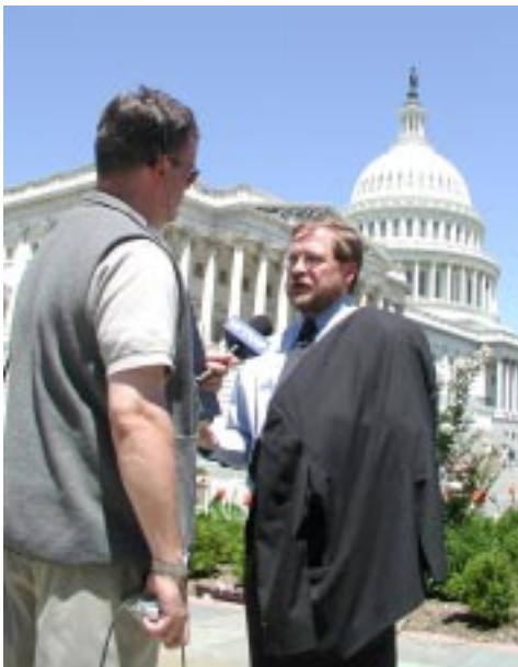
ATR President Grover Norquist with a reporter after the July 6th Cost of Government Day press conference. The conference was carried live on C-SPAN.

As the most influential taxpayer group in the country, Americans for Tax Reform has the important responsibility of gaining visibility for the ideas of low taxes, free enterprise and economic freedom in the nation's media sources.